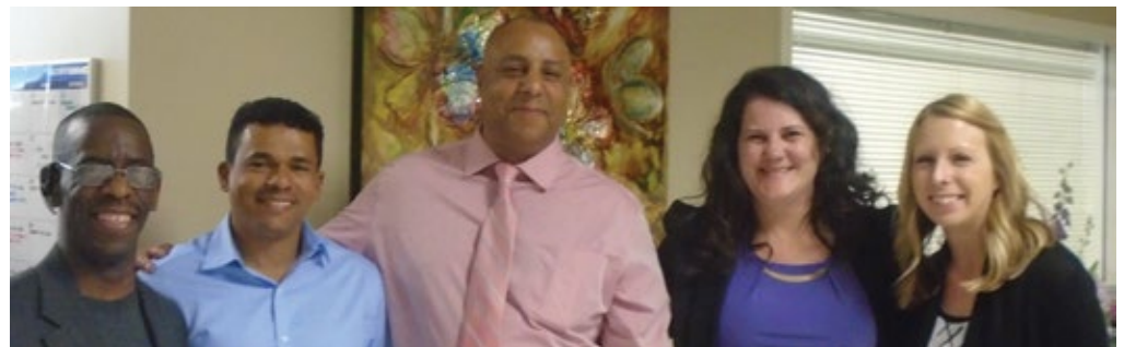
ALL SMILES AS NEW BEGINNINGS STAFF GATHER FOR THEIR GRAND OPENING CELEBRATION